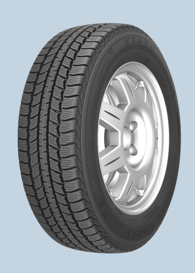
KR500 Komendo Winter 1