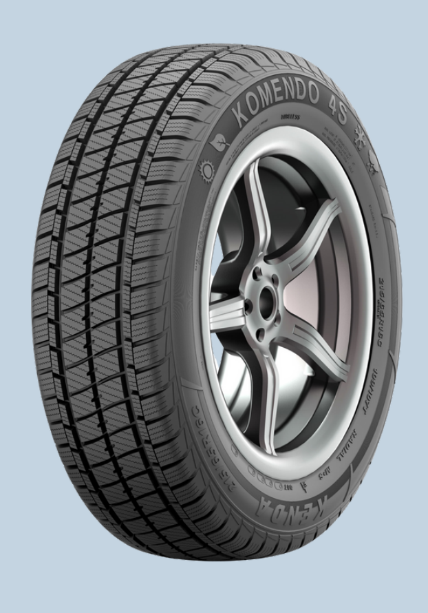
KR105 Komendo 4S