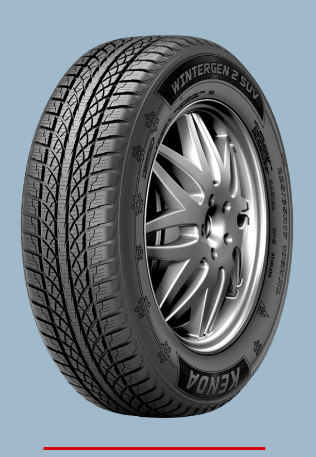
KR504 Wintergen 2 SUV