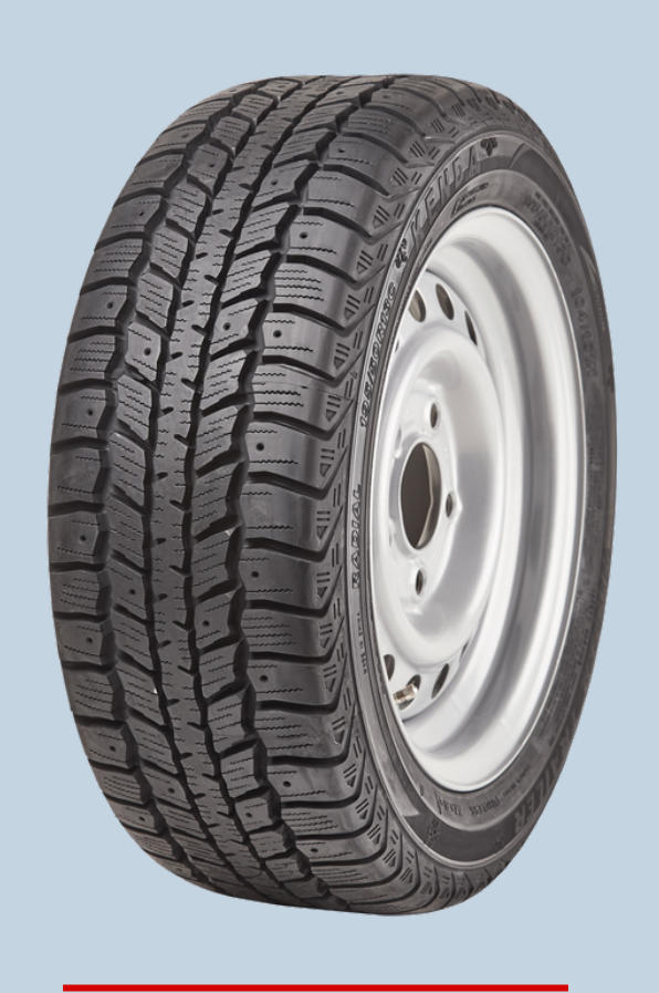
KR500 Winter Trailer Studdable