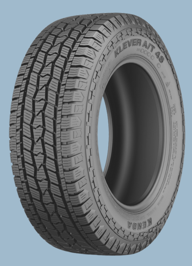
KR615 Klever A/T SUV