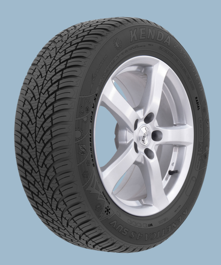
KR609 Kenetica 4S